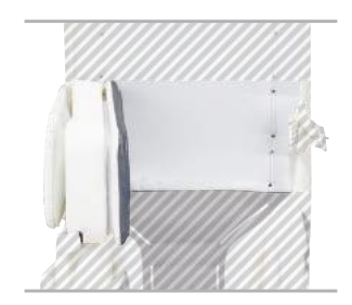
RECESSED FOAM NO WRAP