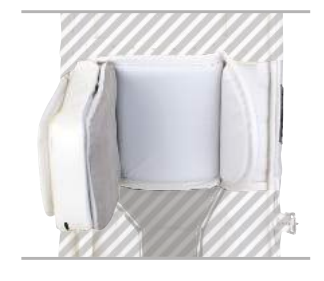
SOFT FOAM NO OUTER KNEE WRAP

KNEE CRADLE OPTIONS ARE BASED ON THE TYPE OF KNEE PROTECTOR YOU WEAR AND HOW MUCH ROOM IS NEEDED TO TRANSITION FROM THE CENTER OF THE GOAL PAD INTO THE KNEE RAISER TO CREATE A SOLID SEAL TO THE ICE.