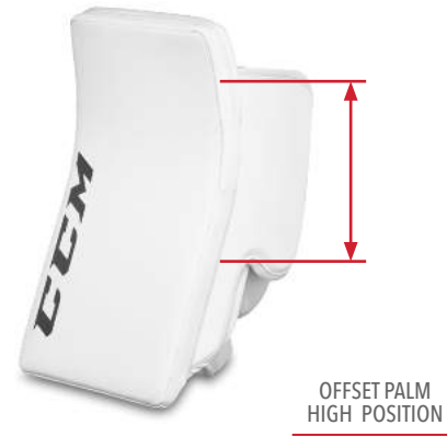
* ONLY OFFERED ON ONE PIECE CUFF CONSTRUCTION