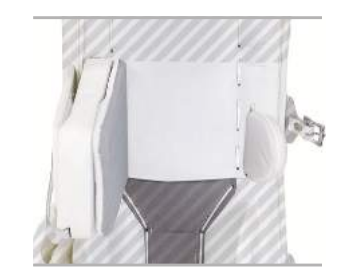
RECESSED FOAM WITH KNEE CRADLE WRAP*