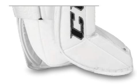
NO STRAP STOCK OPTION