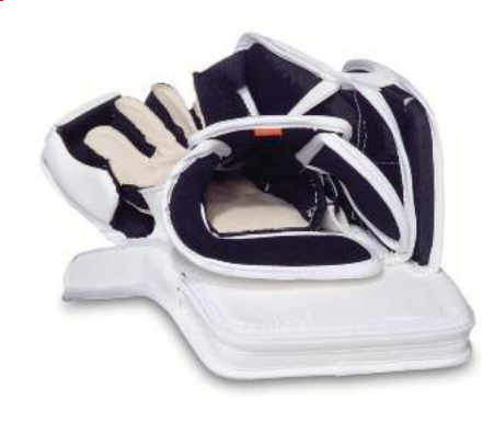
ONE- PIECE CUFF