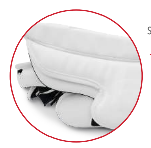
STRAIGHT FINGER PROTECTION