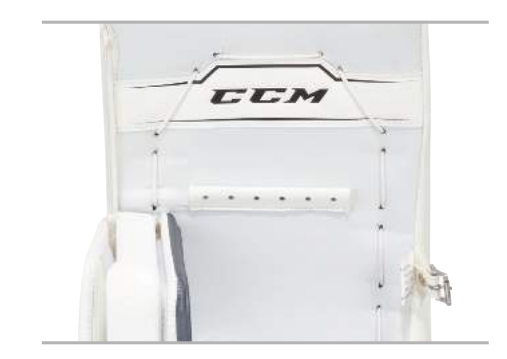
NO LACE TAB