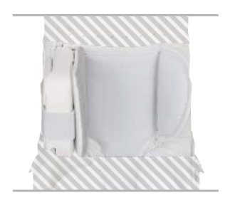
SOFT SUPER TIGHT FIT