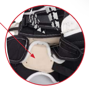
GREY NASH (STOCK OPTION)