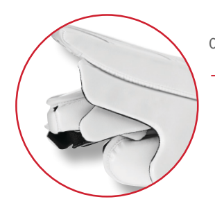
CURVED FINGER PROTECTION