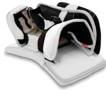
HALF PIECE CUFF