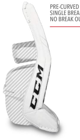
SINGLE BREAK CORE NO BREAK OUTER

FLEX OPTIONS OPTIMIZE INTERNAL AND EXTERNAL FLEX POINTS THAT CAN PROVIDE MAXIMUM COVERAGE BASED ON THE WIDTH OF YOUR BUTTERFLY AND DESIRED FLEXIBILITY ABOVE THE KNEE.