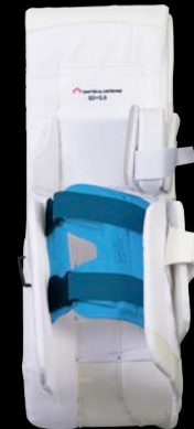
TIGHT FIT FR5 NO CALF STRAP - NYLON 2"