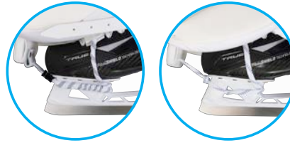
JEN PRO - HD FOAM WITH HYBRIDE BUNGEE LACE