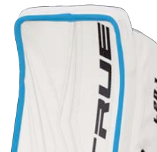
585 WITH BINDING