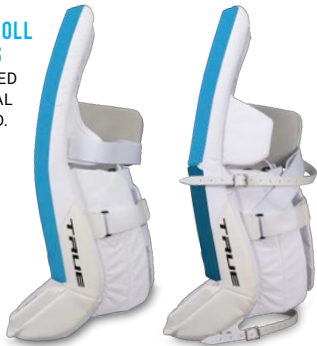
NO BREAK OUTER ROLL