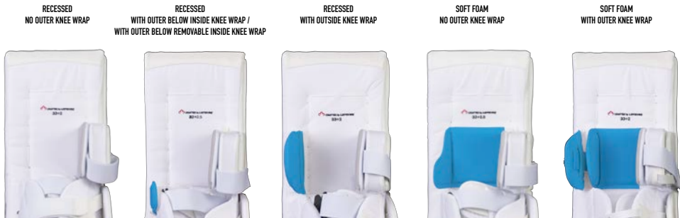
RECESSED NO OUTER KNEE WRAP